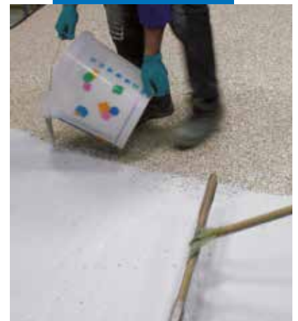
Application of Ultratop on the hardened surface of the mixture made of natural aggregates + Mapefloor 910