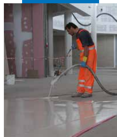
Mechanical application of Ultratop