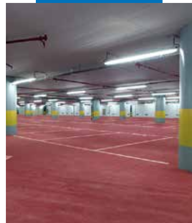
Floor made using red Ultratop in the Berlaymont Building, Brussels