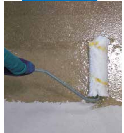
“Terrazzo alla veneziana” effect. Application of Mapefloor I 910

After the finishing treatment, apply a coat