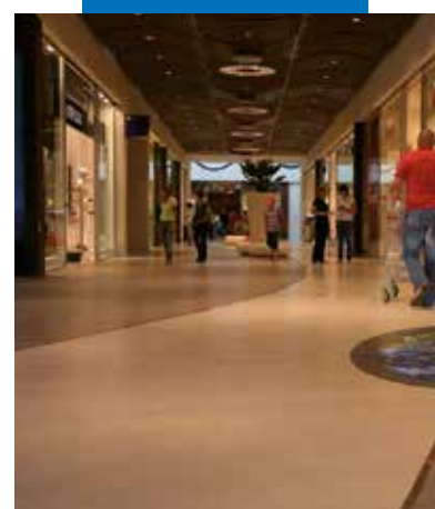
The final result of a floor made using Ultratop