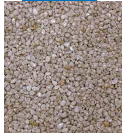
Application of the mixture of natural aggregates + Mapefloor I 910