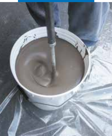
Preparation of the product with a drill