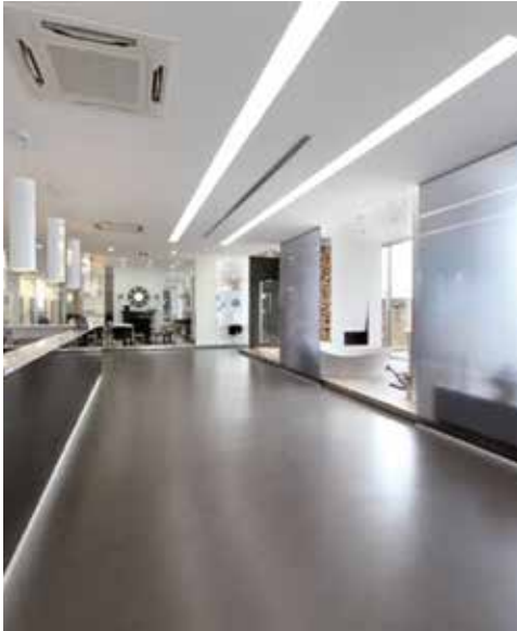
Show-Room Quartarella Altamura (BA) - Italy. "Natural effect" anthracite Ultratop

of Mapelux Lucida or Mapelux Opaca metallic wax to make successive cleaning and maintenance operations simpler.