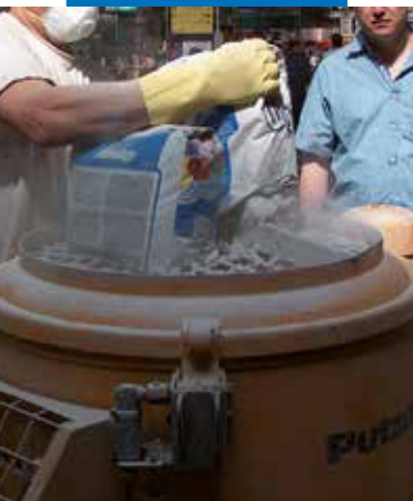
Preparation of Ultratop in a mixer

respectively, after 28 days, A9 is the Böhme abrasion-resistance coefficient and A2 fl -s1 is the fire-reaction class.