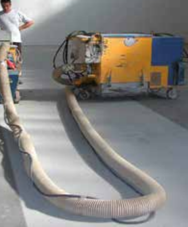
Preparation of the substrate by shot-blasting