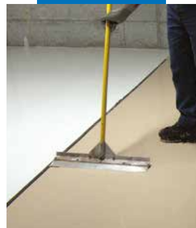
Smoothing Ultratop immediately after spreading